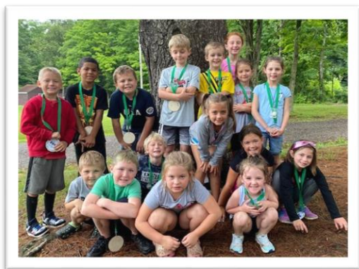
Cloverbud Camp 2021

All funds the Geauga County 4-H Program receives from the Paper Clover Campaigns are used to provide full camperships for Cloverbuds to attend our Cloverbud Camp in July.