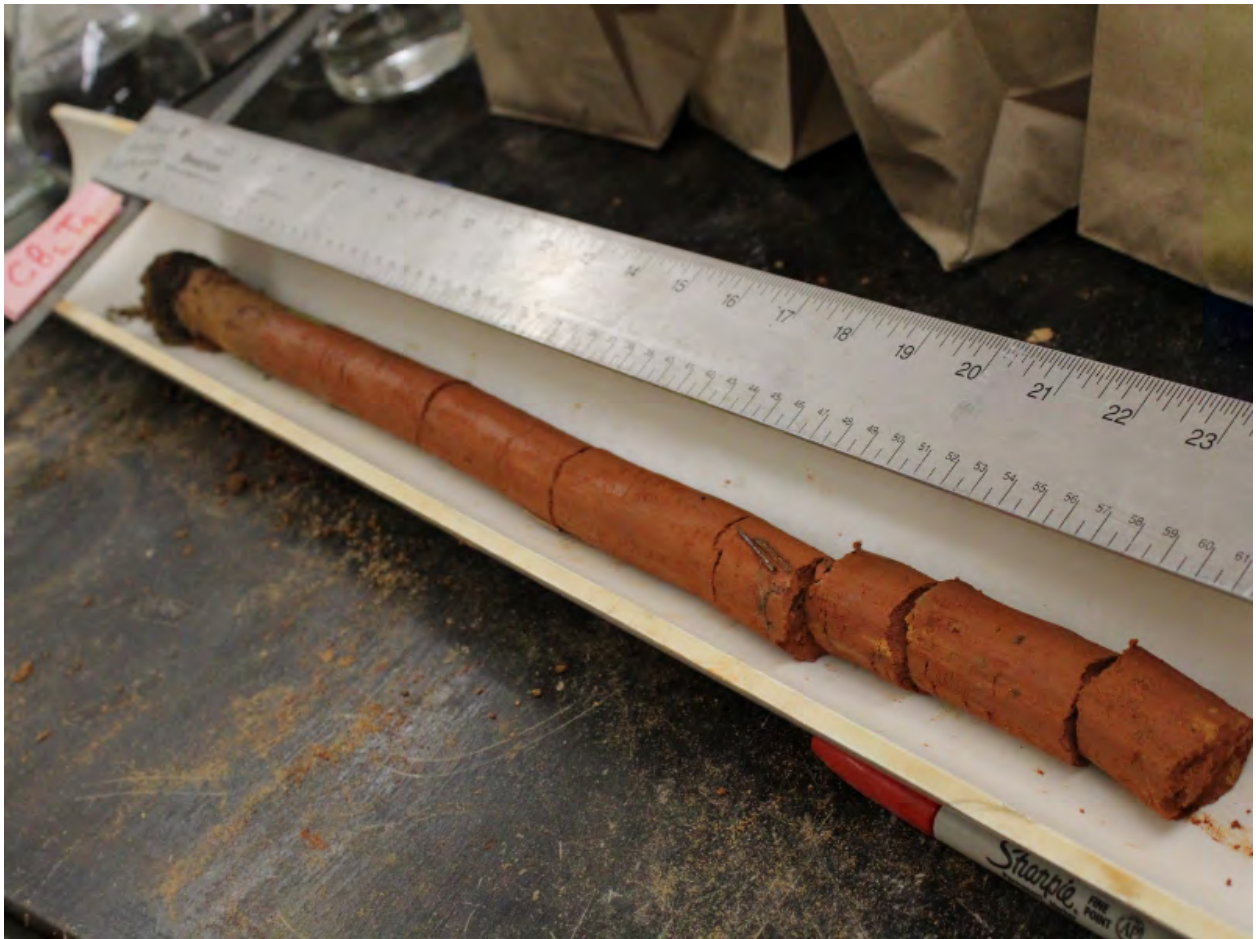
Figure 2 Scientists collect cores of soil at various depths. Shown, a soil core of about two feet is measured and sectioned into respective depths for soil testing. Several chemical, physical and biological tests are better or worse for different kinds of soil.

They found that the Mehlich 3 test extracted about 1.5 times as much phosphorus as the Mehlich 1 test, and about the same as Lancaster. The results indicated Mehlich 3