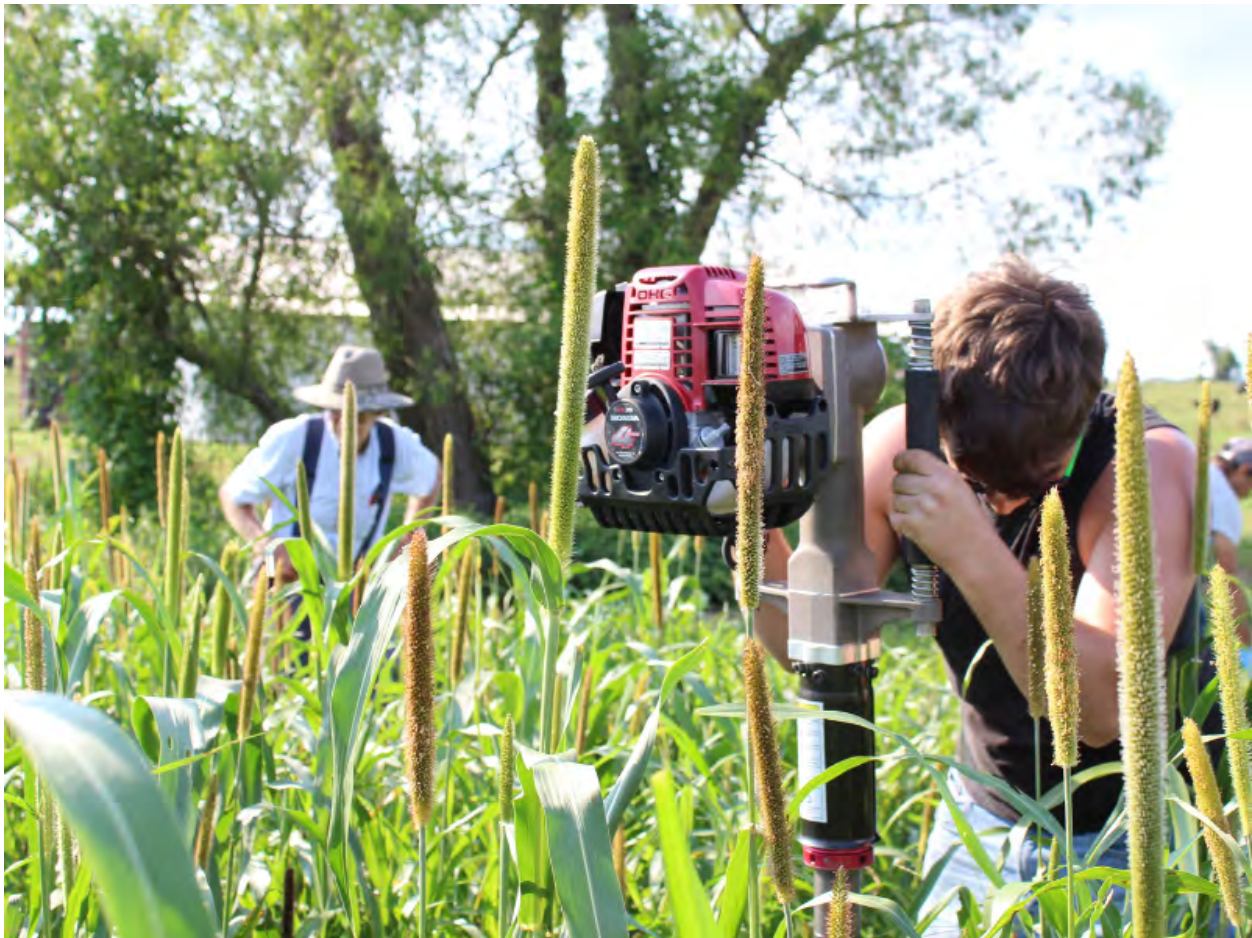
Figure 3 A graduate student from the Auburn team (foreground) collects soil cores for the study in 2018 while demonstrating to a farmer (background) about the collection process. Farmers can use soil tests to tell how much fertilizer to add or if nutrients might

While the Mehlich 3 test seemed like the clear winner, it will take more research to fully implement it across Alabama. “For agronomic fertilizer recommendations within a state or soil region, extensive field calibration and verification studies are required,” says Prasad. “The calibration study is expensive as well as time consuming.”