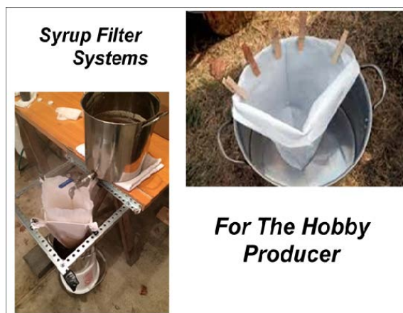
Figure 18. Systems for filtering sap.

Filter hot syrup through clean wool or synthetic syrup filters to remove sugar sand and other suspended solids (Figure 18). Never use cloths or towels washed in a detergent, as it will impart an off flavor in the syrup. After filtering, syrup that is to be used immediately can be cooled and refrigerated. The rest of the syrup should be packaged hot in tightly sealed, clean, airtight containers. For safe storage, syrup temperature for packaging should be at least 180 degrees Fahrenheit and preferably 185 degrees F. After filling and sealing the containers, immediately invert them for a short time to flood the container neck and lid bottom with hot syrup. Hot packed maple syrup will store for months in an unopened container. Once opened, it should be refrigerated. Syrup can be stored for years in the freezer.