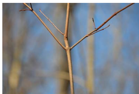
Figure 1. Opposite branching of sugar maple.

The maples belong to a small category of deciduous trees that are "opposite"—opposite branching, leaves attached and buds are opposite (Figure 1). To identify your trees, start when the leaves are on the tree as it is a much easier. Below