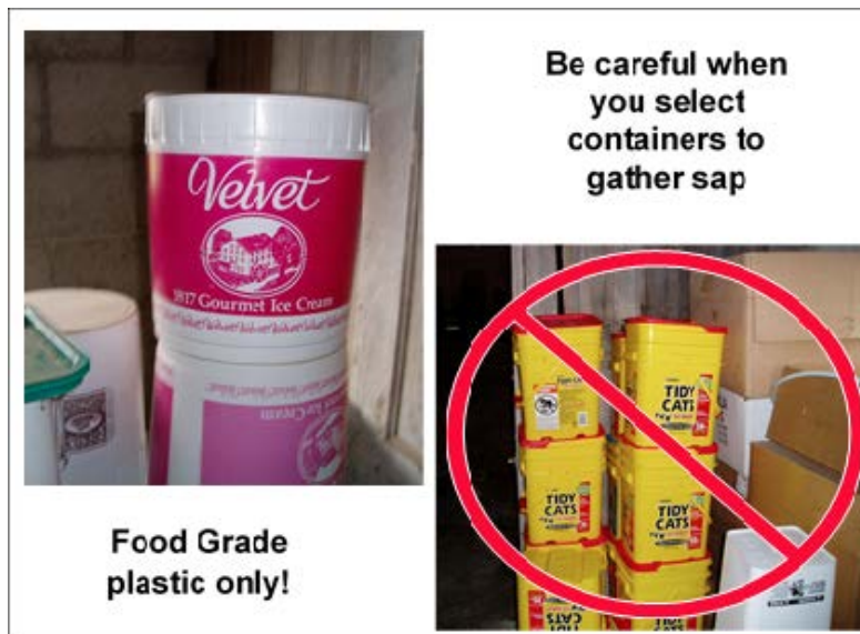
Figure 8. Use food grade containers only.

Once you have explored your yard and identified all the potential trees to tap, the next step is to assemble the equipment that you will need to launch your backyard maple adventure. If you are only tapping a few trees, this is not a big deal and for the most part the equipment you will need is readily available. However, there are a few rules that you need to follow if you are going to be successful in producing a jar of one of nature's sweetest treasures.