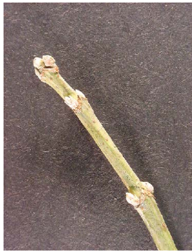
Figure 3. Boxelder leaf and bud.