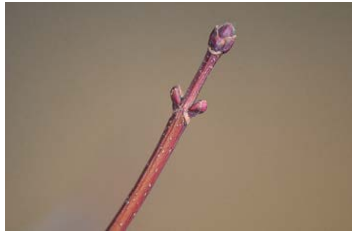
Figure 5. Silver maple leaf and bud.