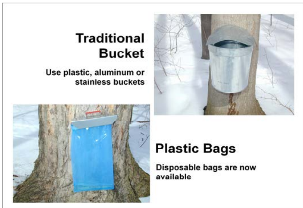
Figure 10. Buckets or plastic bags for collecting sap.

The sap-collecting bucket should be made of plastic, aluminum or stainless steel (Figure 10). Old tin buckets should not be used because they contain lead. Many hobby producers find it convenient and more economical to buy plastic bags from a maple equipment supplier. Some of the bags can be washed out and reused but if sap spoils in them, they need to be discarded. The cost is minimal and they are really easy to use. Bags are held in place by a bag clip that has a hole to go over the spout and hold it in place. You can watch them fill up as the sap runs and you do not need a cover. If you use buckets, consider purchasing a cover to keep the rain out. Many maple equipment suppliers have put together a beginner's kit that includes everything you need to tap a maple tree.