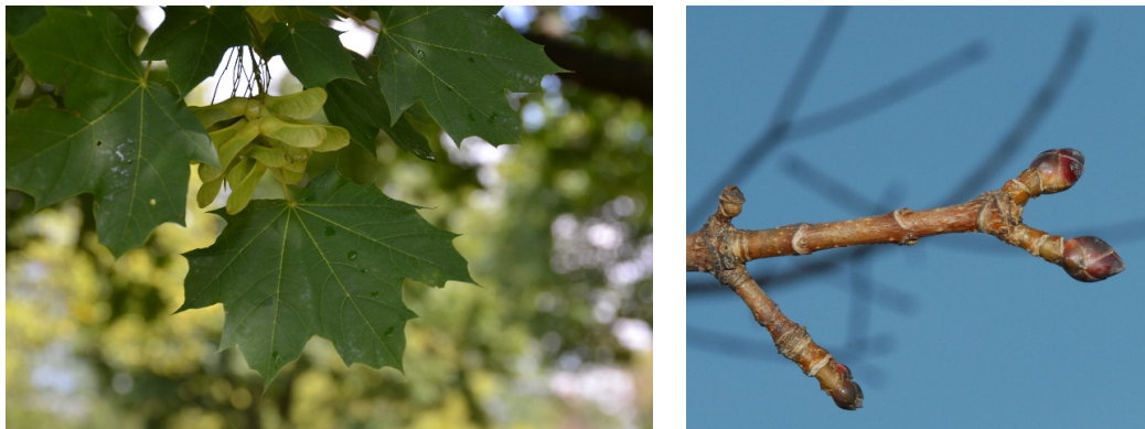
Figure 7. Norway maple leaf and bud.

All of these maple species can be used to produce syrup. With sugar maple, it takes about 43 gallons of sap to produce 1 gallon of syrup. The lower the sugar content of the sap, the more gallons of sap that are needed to produce a gallon of syrup. Also, the lower the sugar content, the more fuel and time it will take to boil down the sap. Today, commercial producers can use technology to shorten this boil time. A reverse osmosis machine removes 75 percent of the sap's water content before the boiling process even starts.