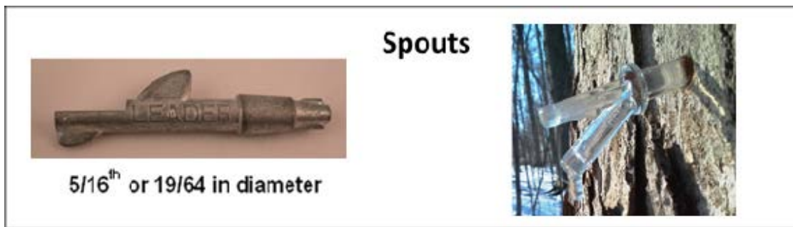
Figure 9. Types of spouts.

The sap-collecting bucket should be made of plastic, aluminum or stainless steel (Figure 10). Old tin buckets should not be used because they contain lead. Many hobby producers find it convenient and more economical to buy plastic bags from a maple equipment supplier. Some of the bags can be washed out and reused but if sap spoils in them, they need to be discarded. The cost is minimal and they are really easy to use. Bags are held in place by a bag clip that has a hole to go over the spout and hold it in place. You can watch them fill up as the sap runs and you do not need a cover. If you use buckets, consider purchasing a cover to keep the rain out. Many maple equipment suppliers have put together a beginner's kit that includes everything you need to tap a maple tree.