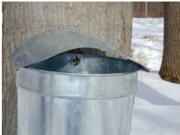
Figure 12. Bucket with cover.

The next step is to place the tap and set the collection bucket or bag (Figure 12). Push the spout into the hole until it is snug, and then use a light hammer or a rubber mallet to set the spout with a gentle tap. Do not use a big hammer and over drive the spout or you may crack the hole on the top and the bottom causing it to leak sap. Some tap holes will naturally leak sap and show dampness around the hole (Figure 13). These spouts may need to be driven in a little more at a later time. This happens a lot if the wood is still frozen at tapping time. You will know if you have done a good job after the first windy day. Your taps will not be leaking and all of your buckets will be hanging where you put them. Place a cover over the bucket to keep rain out. If your area has slope, you can tie several trees together with a mini tubing system into a larger container. You can set up a dump station that you can empty your containers into then pump sap out from there. The only thing that limits your ability to collect sap is the limits of your imagination.