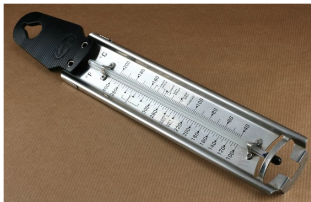
Figure 16. Candy thermometer.

One essential tool you absolutely need to have is a candy thermometer (Figure 16). This will allow you to monitor the boiling point throughout the entire process of making syrup.