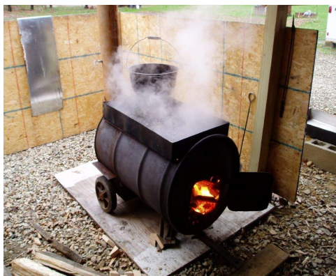
Figure 15. Boiling sap on a barrel stove with a preheating pan.

Rates of evaporation from a flat bottom pan are highly variable. Depending on many factors, including the size of the heat source and the type, size and construction of the pan, they may range from as little as \frac{3}{4} to more than 1\frac{1}{2} gallons of water for each square foot of liquid surface. A 12-inch square or 14 inch in diameter circular pan both have 1 square foot of liquid surface. Remember, 43 gallons of sap are required to produce 1 gallon of syrup—42 gallons of water must be evaporated. It will normally require somewhere between 28 and 56 hours of continuous boiling (and sap refilling) if a pan with 1 square foot of liquid surface is used. By comparison, a gallon of syrup can be produced in between nine and 18 hours using a rectangular 24 x 18 inch pan (3 square feet of liquid surface). Obviously, the larger the pan, the more quickly the evaporation process will be completed. Do not overfill the pan, as boiling sap usually rolls and foams. To avoid burning or scorching, monitor the heat carefully (do not let the heat get too high), and keep at least 1\frac{1}{2} inches of liquid in the pan. The risk of scorching increases as the density of the liquid increases.