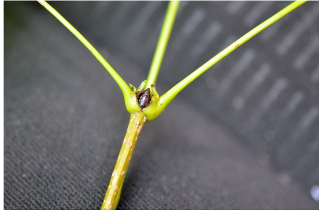
Figure 2. Black maple bud and leaf.