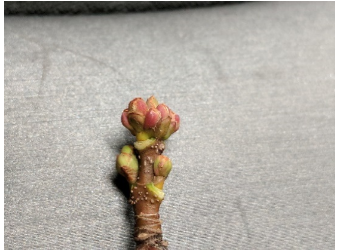
Figure 4. Red maple leaf and bud.