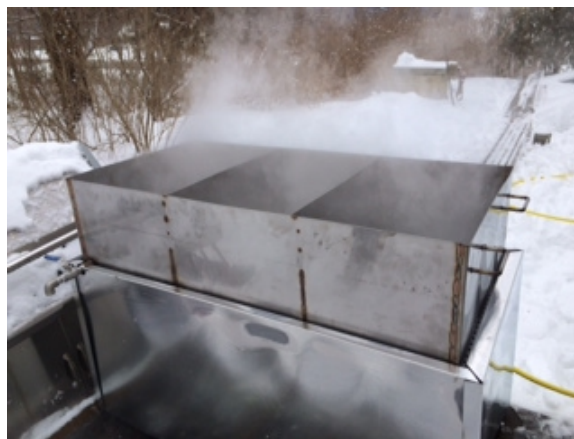
Figure 14. Boiling sap.

Most large commercial producers use a continuous feed evaporation process to make syrup (Figure 14). An evaporation pan is designed so that sap is added to the pan at one end and syrup is removed at the other in a "continuous" process. Most hobbyists use a "batch" system, in which sap is placed in a single pan and heated. More sap is then added as water evaporates until a suitable amount of concentrated sap is present. The evaporation process is then continued with no additional sap and the entire batch is "finished" to the desired density.