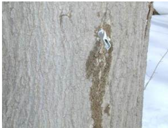
Figure 13. Leaking spout.

Because sap flow depends on weather, it is not always consistent. Some days no sap will flow; other days, as much as a quart to a gallon or more of sap may flow during a flow period (several hours to a day or more).